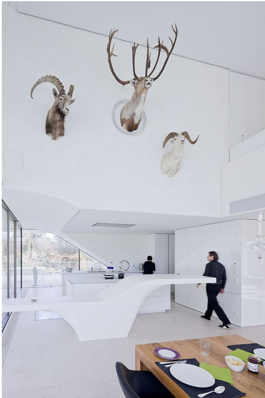
The kitchen countertops of Haus am Weinberg .

Besides the grand entry the lowermost floor contains service spaces, as well as guest quarters, and an apartment that opens onto a small patio and natural pool. One story up, another pool -- a slim swimming pool -- runs along