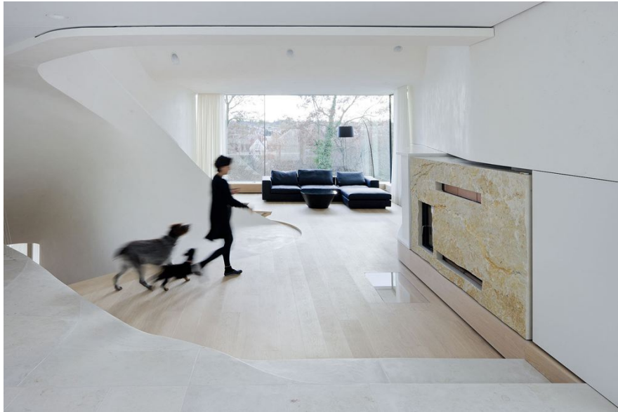
Looking across the dining room of the Haus am Weinberg toward the living room.

The middle floor contains the main living spaces, although the main entrance is on the southeast corner of the lowermost floor. A grand, sculptural stair ascends to the living floor where one arrives at the northern edge of the double-height living space. Just to the north, one further step up leads to a sheltered area beneath an upper-floor bridge that separates the living from the double-height dining space that occupies the home's northwestern corner.