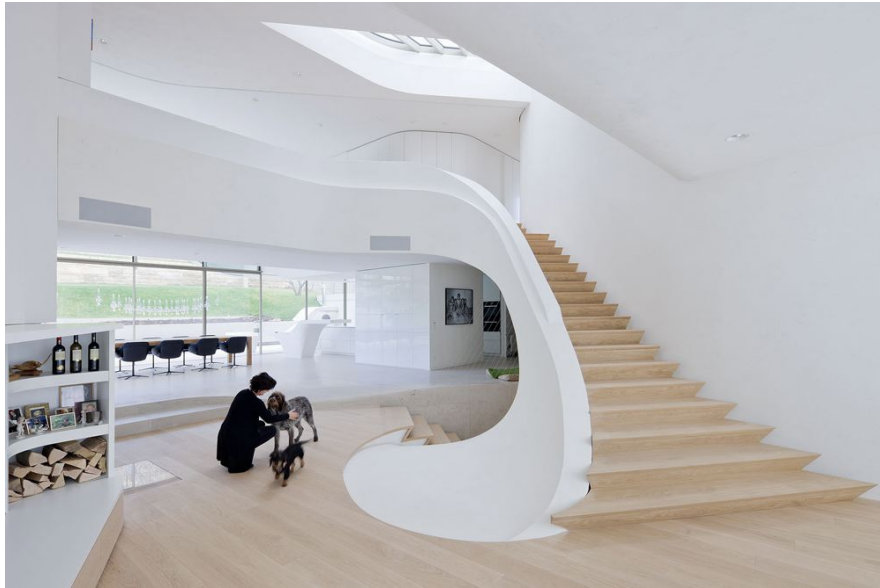
Looking across the living room of the Haus am Weinberg toward the dining space.

Back in the living room, a second grand stair, at ninety degrees to the first, also leads upstairs. And above the stair, a skylight washes the innermost portion of the home with daylight from above. The living room's southern and western walls are glazed, offering a commanding view of the valley.